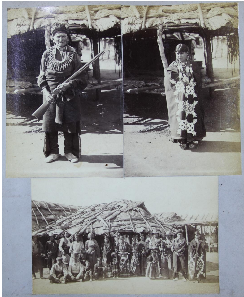
Kickapoo Nation members in El naciemento, Mexico