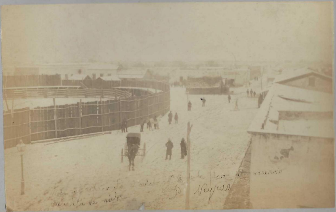
El corral de la plaza de San Juan de los Rios