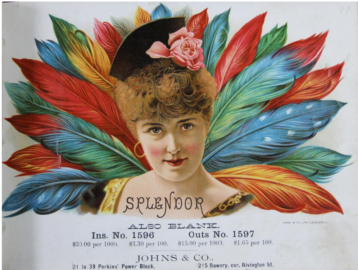
Label from Johns & Co. Sample Book