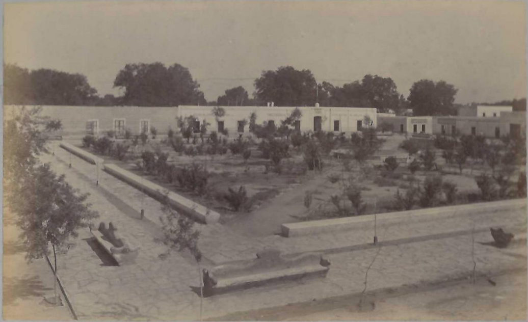
Plaza - Santa Rosa Mexico